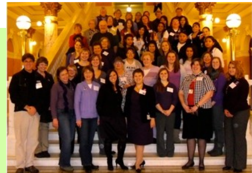
SDANW Women4Women Day 2011